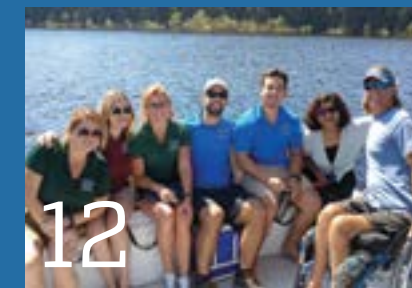
12 Accessible Boating