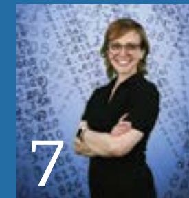
7 UFOT K12 Scholars