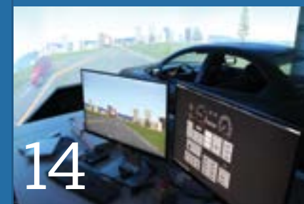
14 Driver Rehabilitation Therapy Program