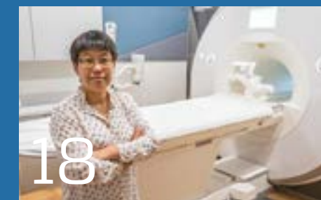
18 Neurocognitive and Behavioral Development Laboratory