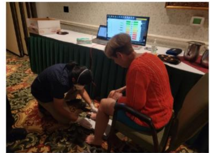
Oak Hammock residents experienced the technology