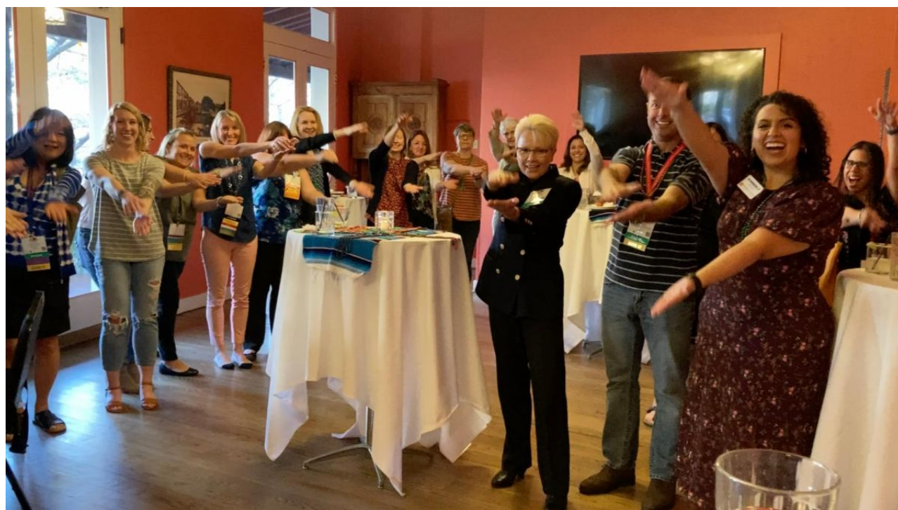
UF OT Alumni Reception at the 2022 AOTA Inspire Conference.