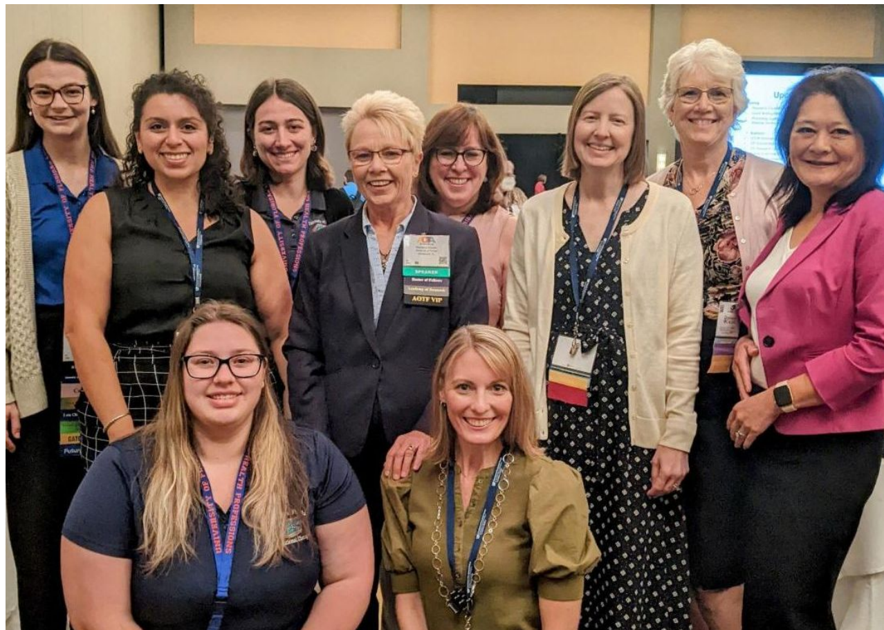
UF OT faculty and students attending the 2022 AOTA Inspire Conference.

booth at the Conference Expo and our UF Alumni Event. Expo Booth and Alumni Event guests included alumni who serve in AOTA leadership, UF OT Advisory Board members, a University Dean, and three UF Master of Occupational Therapy alumni who are new junior faculty at research-intensive and minority-serving institutions. Go Gators!